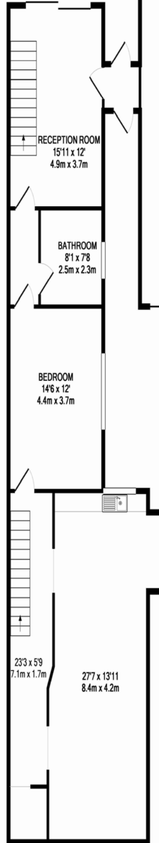
BASEMENT LEVEL APPROX. FLOOR AREA 150.3 SQ.M. (1618 SQ.FT.)